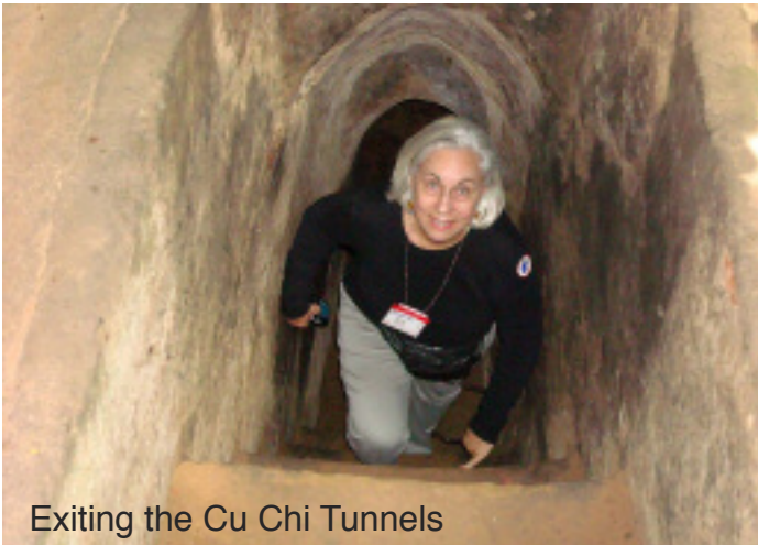
Exiting the Cu Chi Tunnels

Day 1: USA/Aloft. Tour participants depart the USA today. Meal service aloft.