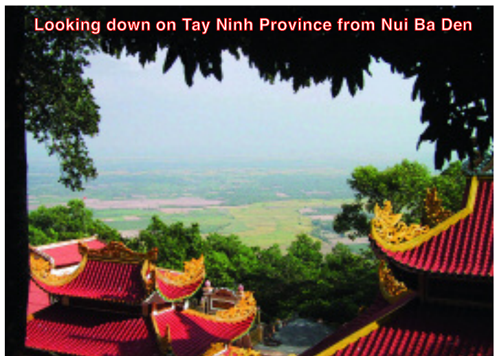
Looking down on Tay Ninh Province from Nui Ba Den