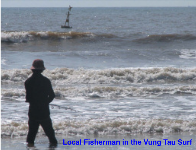
Local Fisherman in the Vung Tau Surf

We offer our travelers an opportunity to tour areas in and around Saigon once called III Corps or the former Saigon Capital Area . The tour is offered on your dates from January through April or October through December. We don't recommend travel during the wet season (May through September).