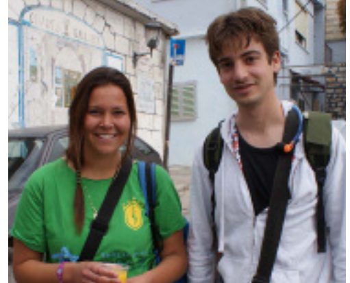
Young Soldiers of the Israeli Defense Force