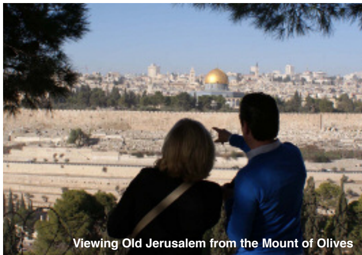
Viewing Old Jerusalem from the Mount of Olives

Another spiritually enriching day begins at the headwaters of the Jordan River, the Yardenit, where Christian visitors come to renew their faith with a traditional Baptism. It was here that John the Baptist baptized Jesus. We then travel to Belvoir Fortress. The fortress became a crusader