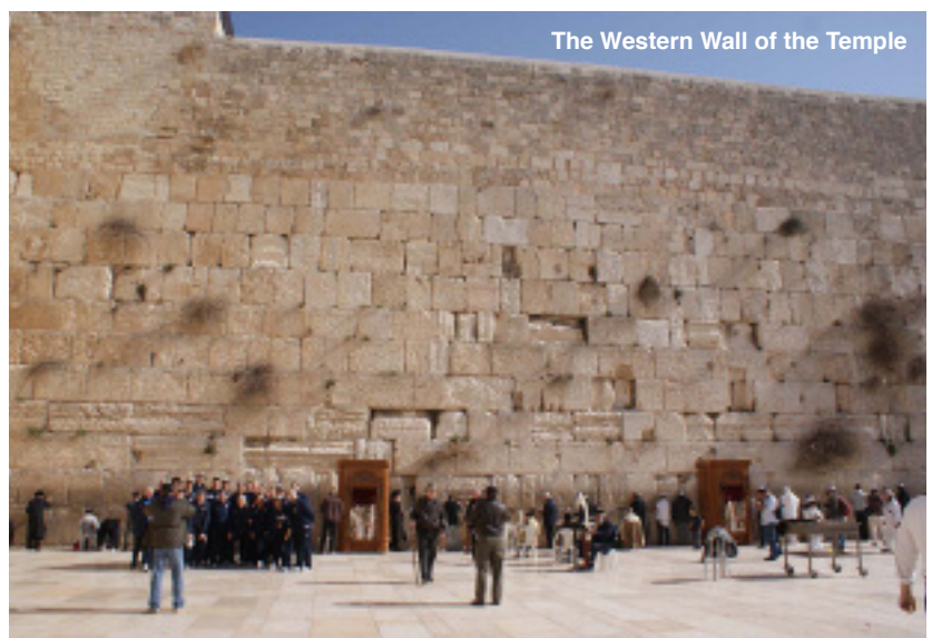
The Western Wall of the Temple