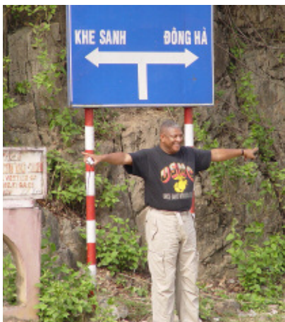
A USMC Vet on Highway #9

Your tour begins in Hanoi. Here in a city that was once an enemy capital, you will be surprised by the warm welcome that awaits American visitors. You have an opportunity to tour Hanoi historic and cultural sites before you move onto I Corps.