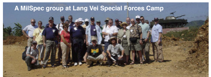
A MilSpec group at Lang Vei Special Forces Camp

An American Tour Manager is available to lead this program. A USMC combat Veteran, he served in I Corps and is familiar with the area and the history of US operations in the region. Subject to additional cost and scheduling.