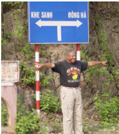
A USMC Vet on Highway #9

Your tour begins in Hanoi. Here in a city that was once an enemy capital, you will be surprised by the warm welcome that awaits American visitors. You have an opportunity to tour Hanoi historic and cultural sites before you move onto I Corps.