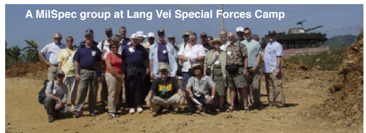
A MilSpec group at Lang Vei Special Forces Camp

An American Tour Manager is available to lead this program. A USMC combat Veteran, he served in I Corps and is familiar with the area and the history of US operations in the region. Subject to additional cost and scheduling.