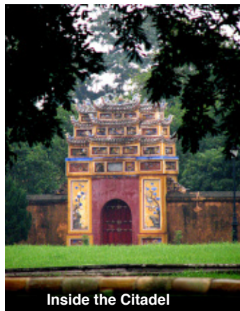
Inside the Citadel

Day 9: DaNang/Hoi An: Today we explore the region around DaNang. We visit Monkey Mountain peninsula where remnants of our long ago base are still visible. Then we go to My Son, a collection of Champa Kingdom temples in the infamous Arizona Territory. As we travel in the area around DaNang we will visit as many of your special places as we can. Later we check into our hotel in Hoi An, an ancient fishing village that was once Vietnam's major port. (B, L, D)