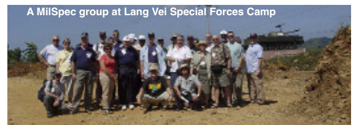
A MilSpec group at Lang Vei Special Forces Camp

An American Tour Manager is available to lead this program. A USMC combat Veteran, he served in I Corps and is familiar with the area and the history of US operations in the region. Subject to additional cost and scheduling.