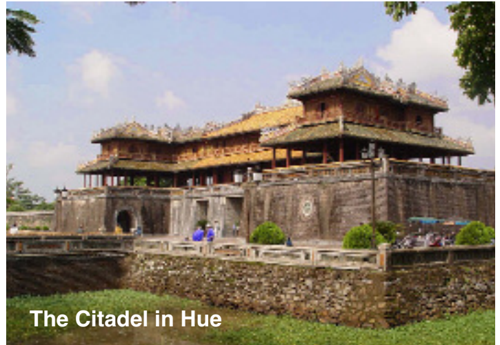
The Citadel in Hue

portunity to see sites around Hue including the world famous Citadel. The Vietnamese have been carefully and skillfully rebuilding and restoring the building in this moated imperial city that were largely destroyed during the 1968 Tet Offensive.