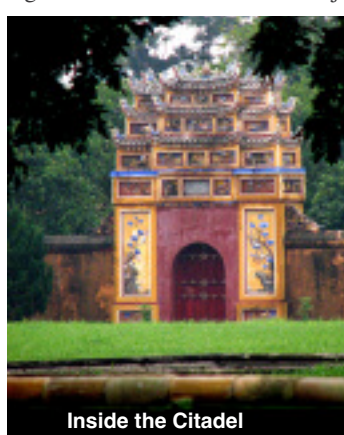
Inside the Citadel

Day 9: DaNang/Hoi An: Today we explore the region around DaNang. We visit Monkey Mountain peninsula where remnants of our long ago base are still visible. Then we go to My Son, a collection of Champa Kingdom temples in the infamous Arizona Territory. As we travel in the area around DaNang we will visit as many of your special places as we can. Later we check into our hotel in Hoi An, an ancient fishing village that was once Vietnam's major port. (B, L, D)