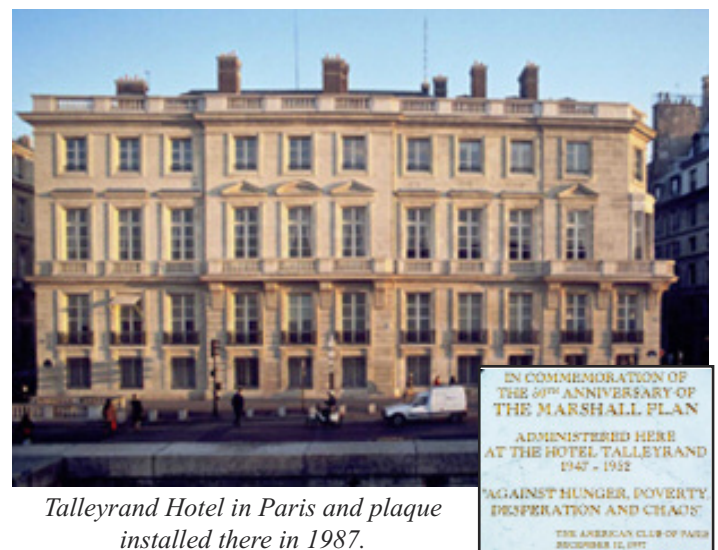
Talleyrand Hotel in Paris and plaque installed there in 1987.