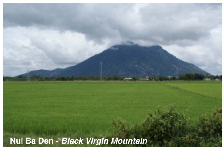
Nui Ba Den - Black Virgin Mountain

Note: Vietnam draws more than 2 million visitors each year. Hotels and flights fill up months in advance. We cannot guarantee last-minute sign-ups. Act today to insure your place on this tour!