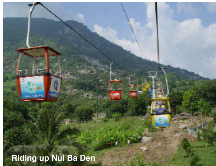
Riding up Nui Ba Den