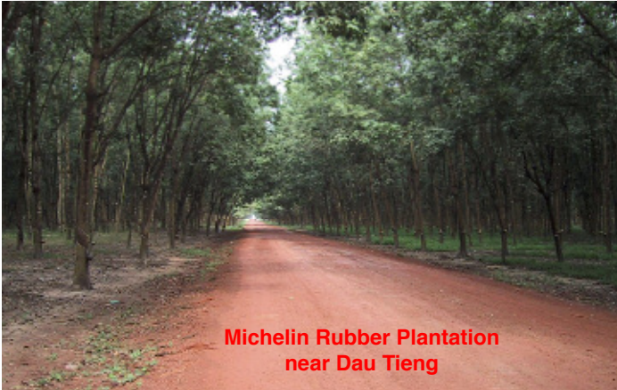
Michelin Rubber Plantation near Dau Tieng

venirs and other quality products. Our tours often include wives and adult children wishing to see where their Veteran served.