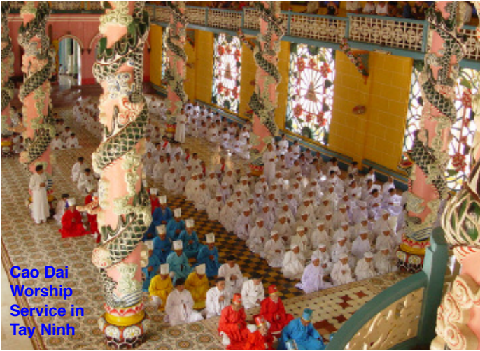
Cao Dai Worship Service in Tay Ninh