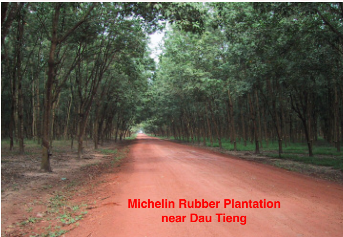
Michelin Rubber Plantation near Dau Tieng

We offer our travelers an opportunity to tour areas in modern central Vietnam where the famed 11th Armored Cavalry Regiment fought during the war. The tour is offered on your dates from January through May or October through December. We don't recommend travel during the wet season (June through September).