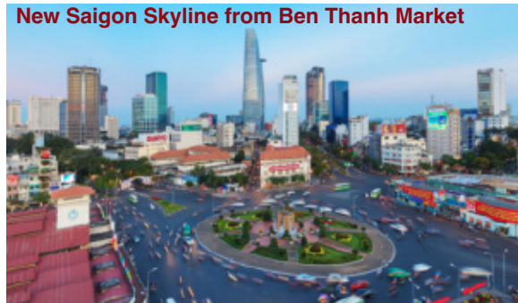
New Saigon Skyline from Ben Thanh Market