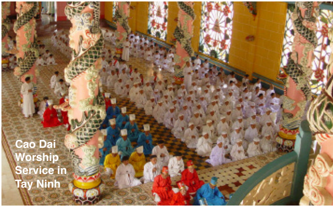
Cao Dai Worship Service in Tay Ninh