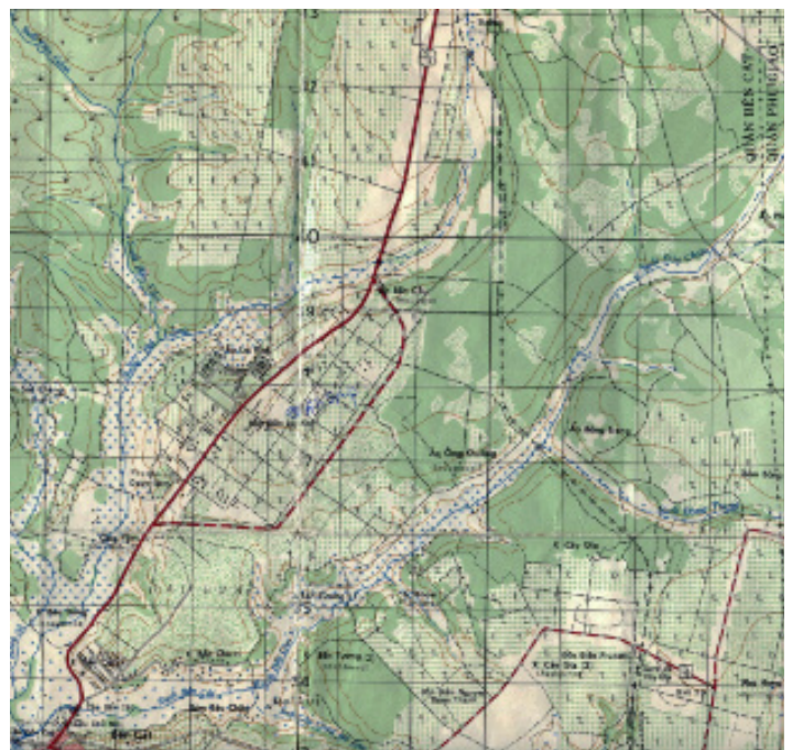
Part of the 11th ACR former Area of Operations